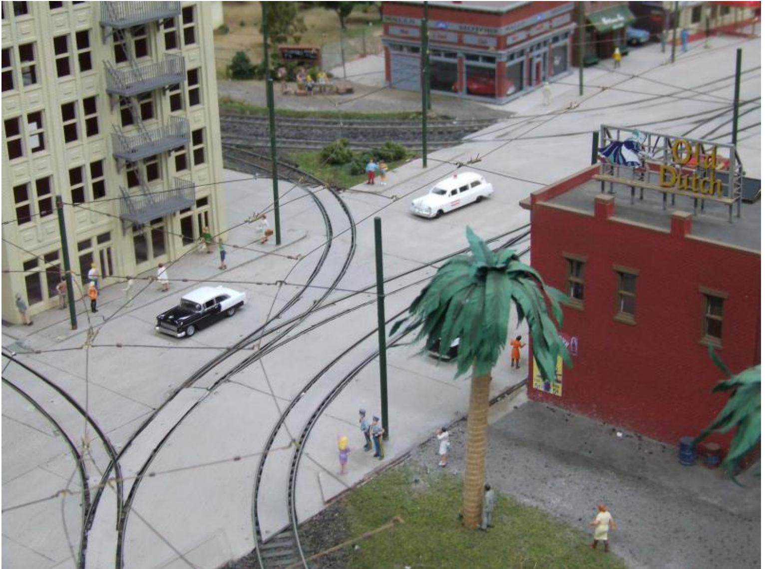
A scene from the Sub-Editor's favourite layout - The Ballarat and District Model Railway Club's ' Phoenix Electric '

Please send items for inclusion in this newsletter to the Editor via e-mail at editor@noarail.com This newsletter is available as a download from our website (address above) saving the club postage and printing. Most pictures are in colour, and notification is sent by email when it is available for download.