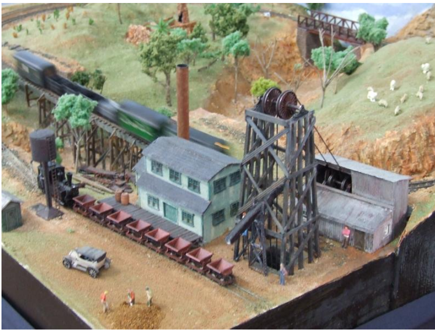
Left: A very nice mining scene in HO n 2½ on 'Goyder Creek' exhibited by Ian Bousfield.