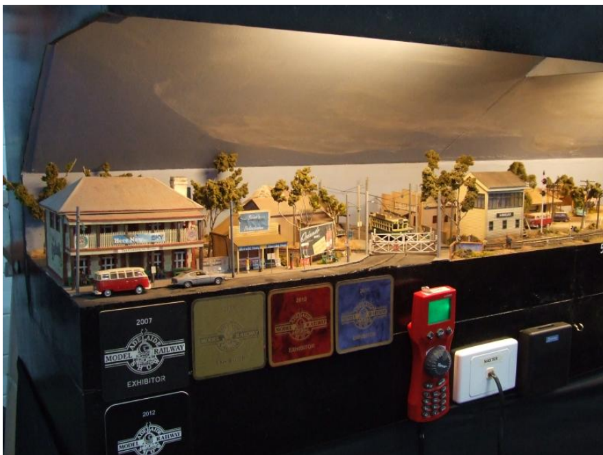
Left: Peter Michalak's much admired 'Liralau' was resplendent at its final public showing. We don't know what Peter's new layout will be, but we know it will be appearing at one of our exhibitions as soon as it's ready!