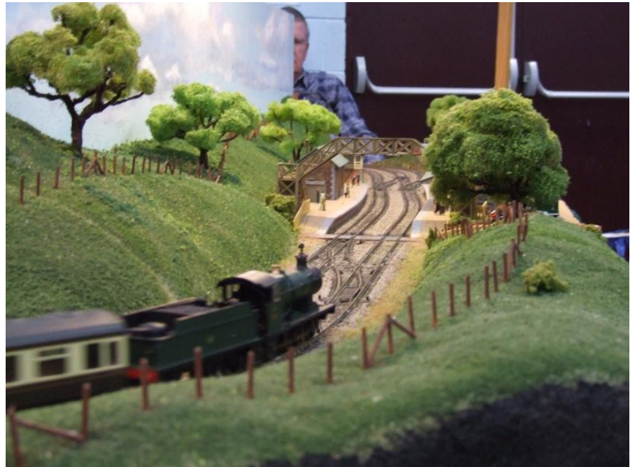
Right: Mike and Rob Partington's superb layout featuring the transition between 'tube' and 'surface' railways at 'Ponders End' .