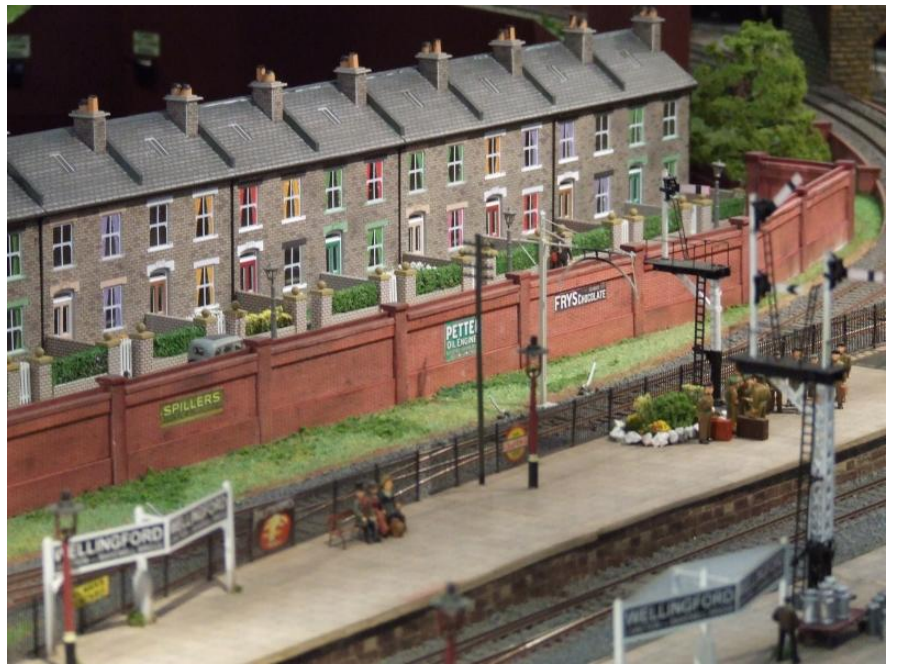
Right: A classic row of English town houses and some interesting signaling infrastructure, just another scene from 'Wellingford and Bakwell Bridge'