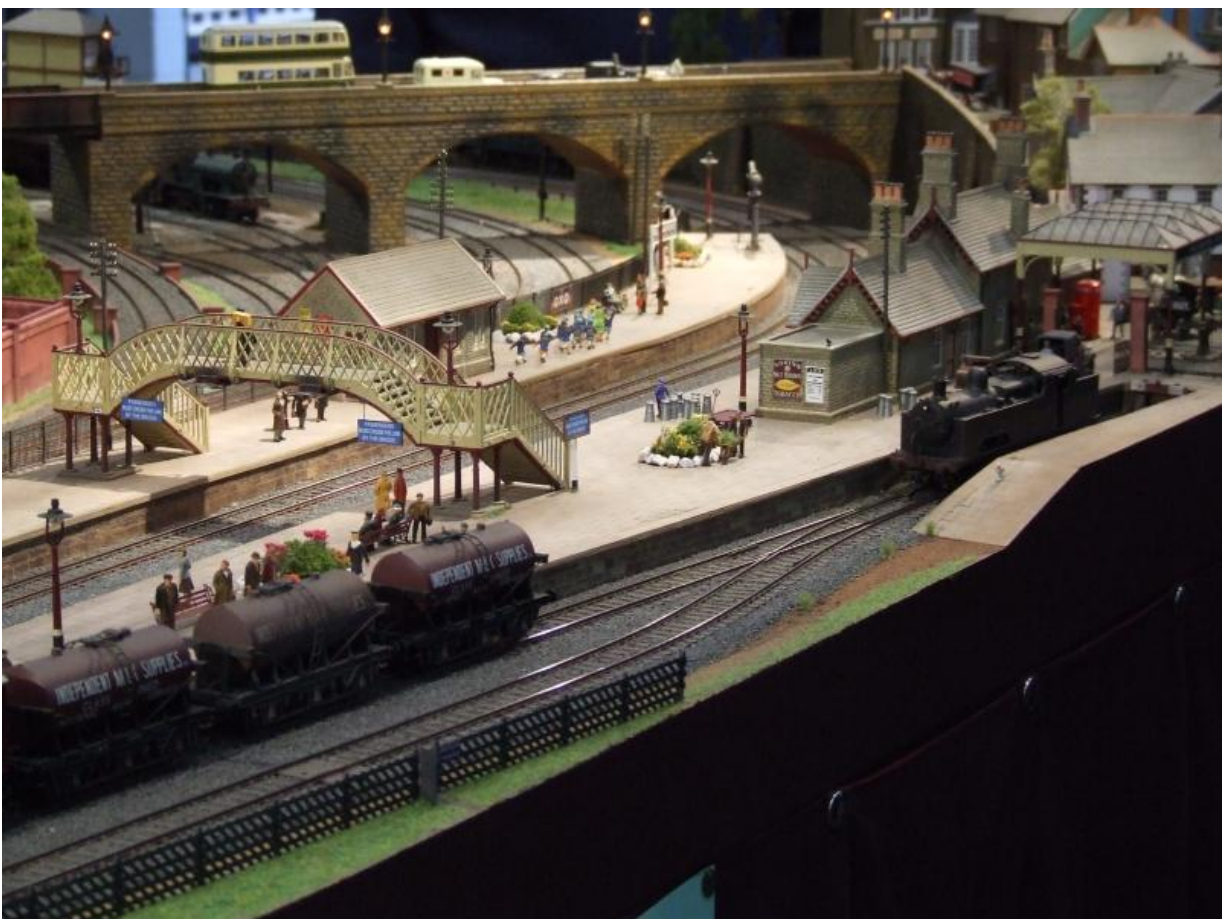
Photos of the multi award winning ' Wellingford and Bakewell Bridge '