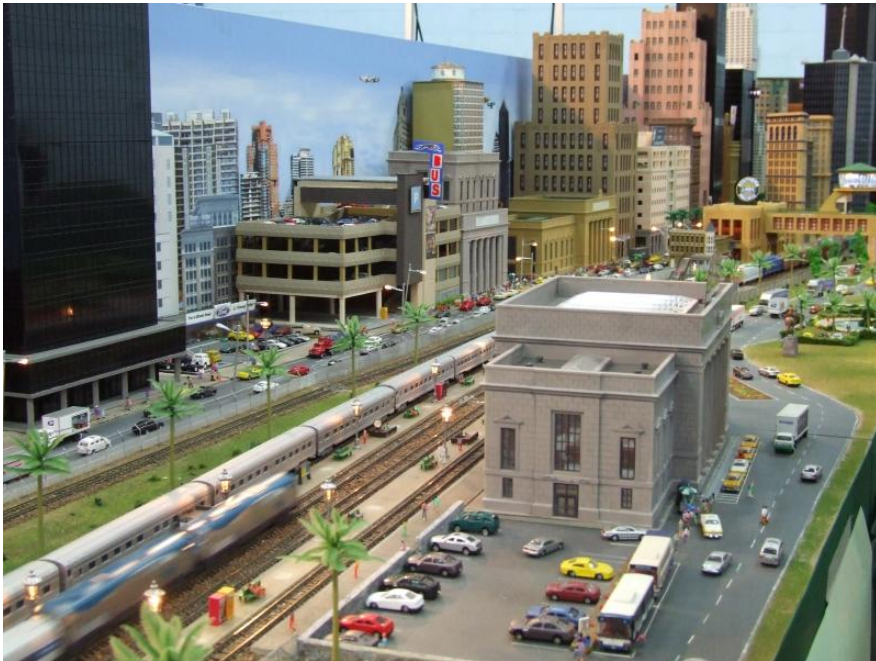
Left: Tall buildings, long N scale trains. What else could it be, but 'Generica' exhibited by the SANGS club.